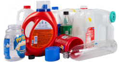
Plastic bottles and containers