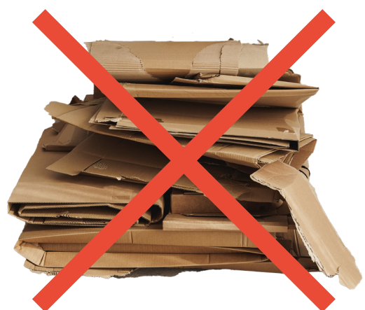
Cardboard boxes and trash bags