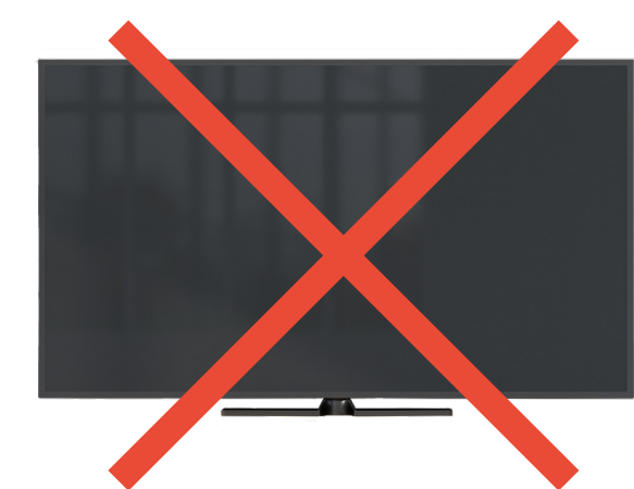
TVs and computers screens