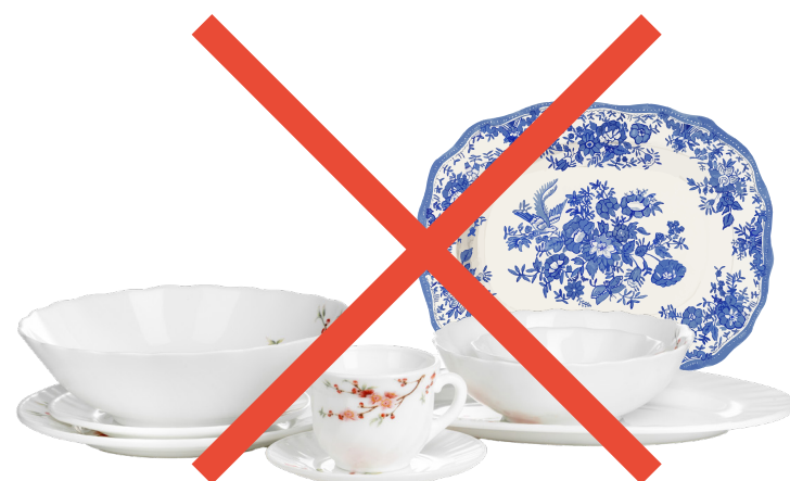
Porcelain, dinnerware, and leaded glass