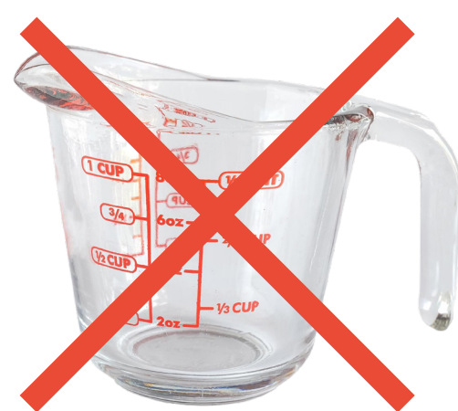
Pyrex and dishware