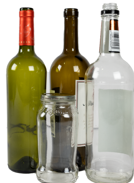
Glass food and beverage containers (labels can stay on)