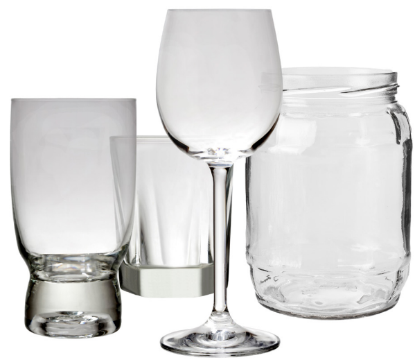
Drinking vessels (pint, wine, mason jars)