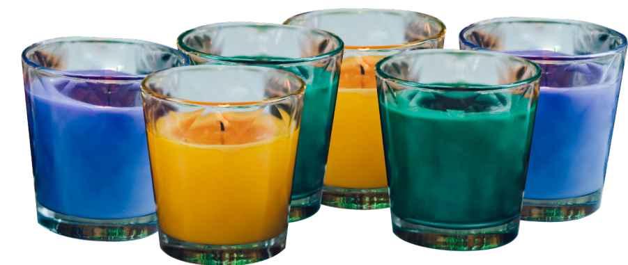
Candle jars (leftover wax allowed)