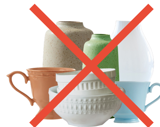
Ceramic and milk glass